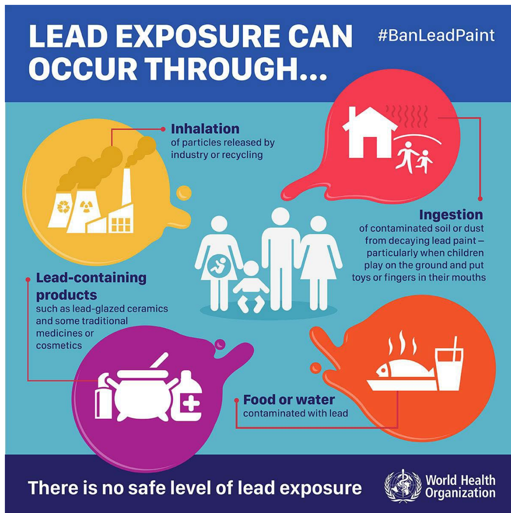
FIGURE 1 | World Health Organization Infographic on Lead Exposure

SOURCE: “Chapter 2. Routes of Lead Exposure, Toxicology, and Societal Costs of Lead Exposure,” in Wisconsin Childhood Lead Poisoning Prevention and Control Handbook for Local Public Health Departments (Wisconsin Department of Health Services, September 2024), https://www.dhs.wisconsin.gov/publications/p00660-2.pdf .