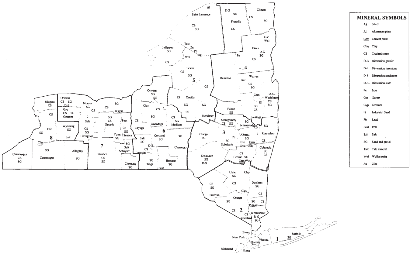
FIGURE O-3 New York State Mineral Resources 2002